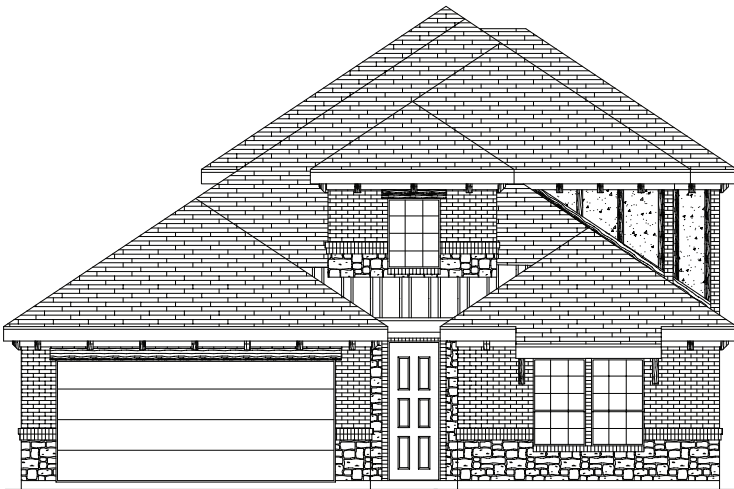
PREMIUM ELEVATION C