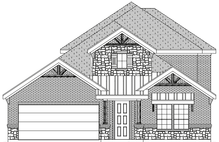
PREMIUM ELEVATION D