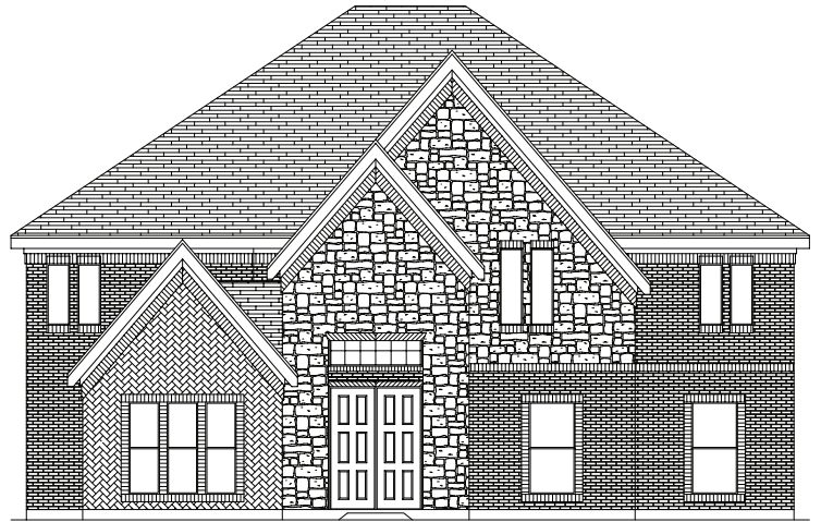
PREMIUM ELEVATION B