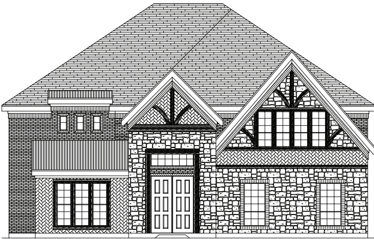
PREMIUM ELEVATION A