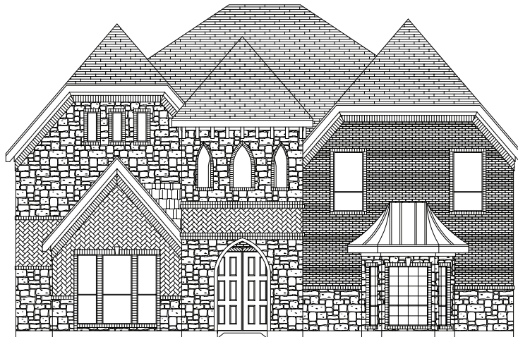
PREMIUM ELEVATION C