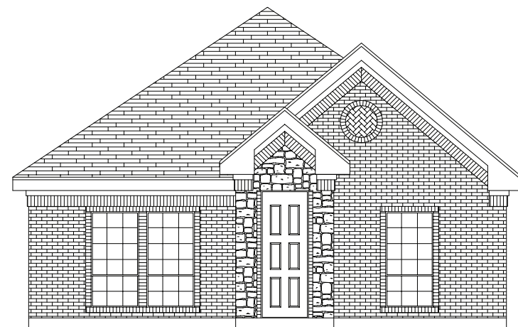
PREMIUM ELEVATION B