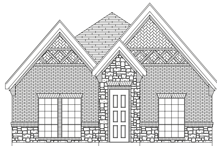
PREMIUM ELEVATION D