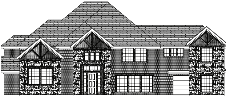
PREMIUM ELEVATION C