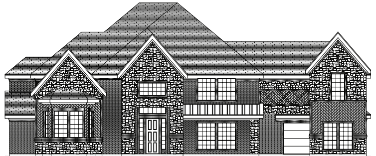
PREMIUM ELEVATION D