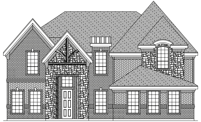
PREMIUM ELEVATION CC