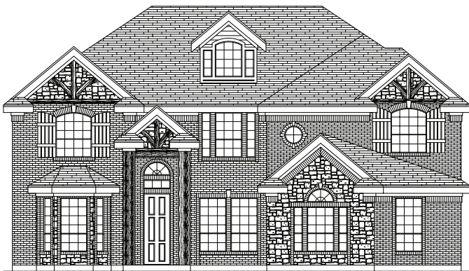
PREMIUM ELEVATION H