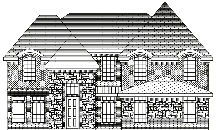
PREMIUM ELEVATION LB