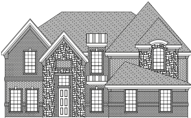
PREMIUM ELEVATION KS