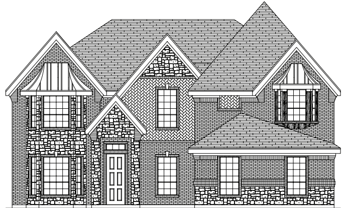
PREMIUM ELEVATION KM