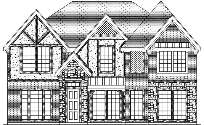
PREMIUM ELEVATION KC