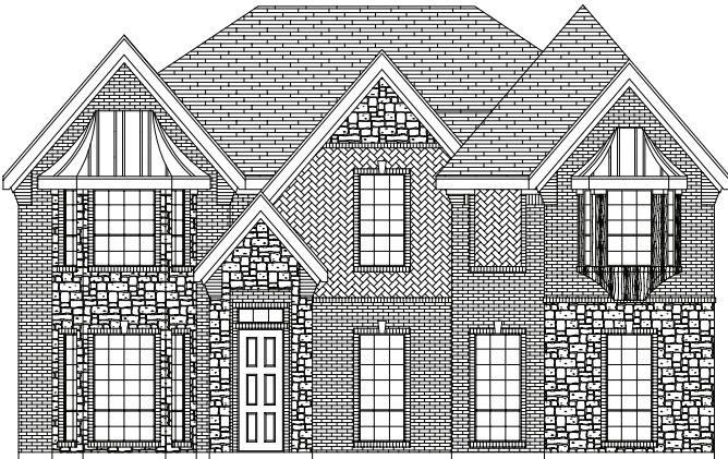
PREMIUM ELEVATION KM