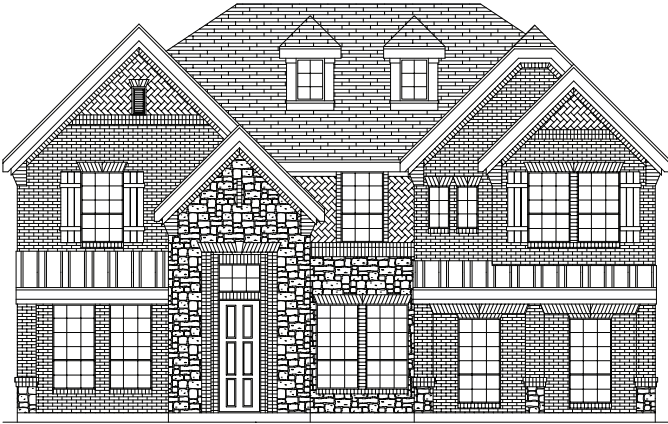
PREMIUM ELEVATION JS