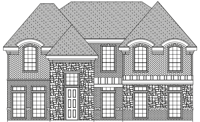
PREMIUM ELEVATION LB