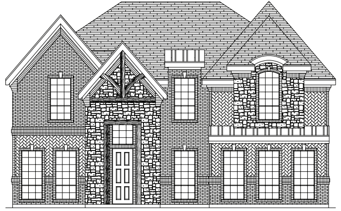
PREMIUM ELEVATION CC