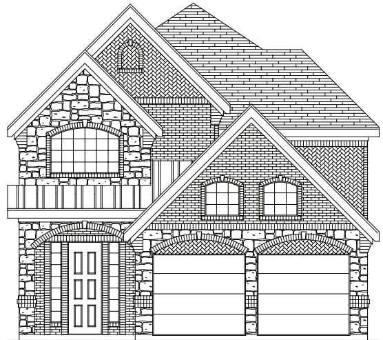
PREMIUM ELEVATION D