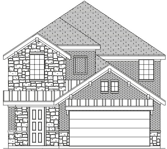
PREMIUM ELEVATION B