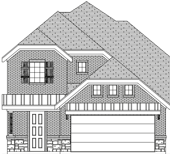
PREMIUM ELEVATION C