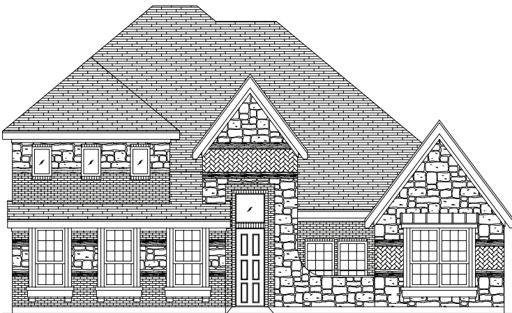
PREMIUM ELEVATION C