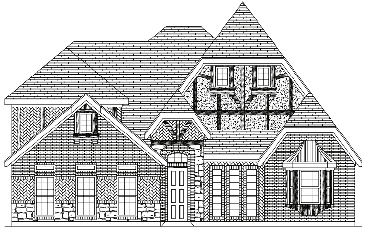
PREMIUM ELEVATION B