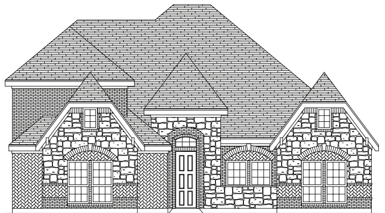
PREMIUM ELEVATION D