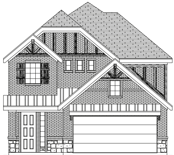
PREMIUM ELEVATION D