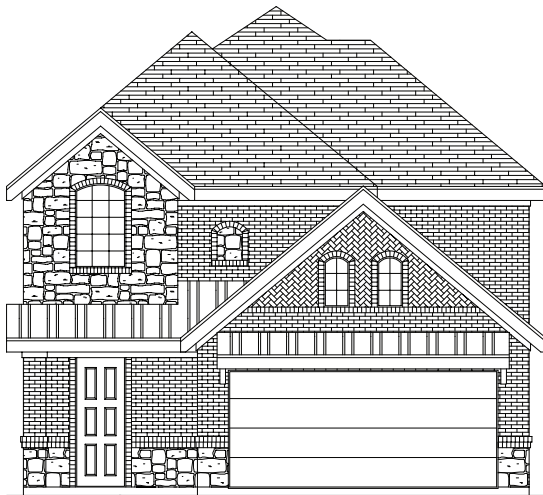
PREMIUM ELEVATION C