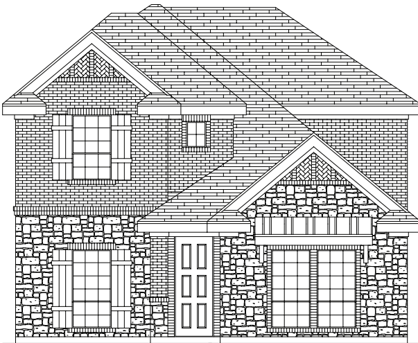
PREMIUM ELEVATION C