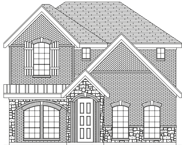
PREMIUM ELEVATION D