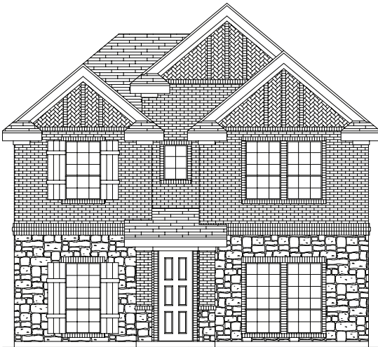
PREMIUM ELEVATION C