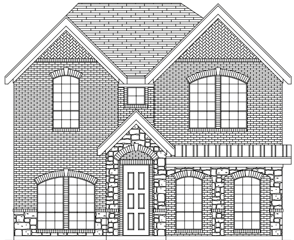
PREMIUM ELEVATION D