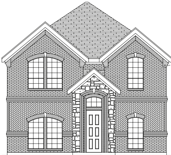
PREMIUM ELEVATION C