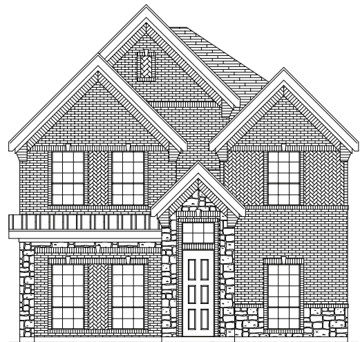
PREMIUM ELEVATION D