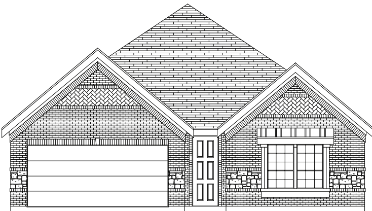
PREMIUM ELEVATION C