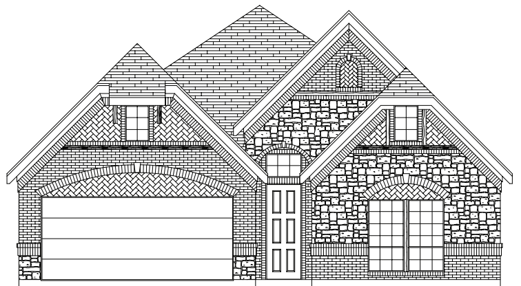
PREMIUM ELEVATION D