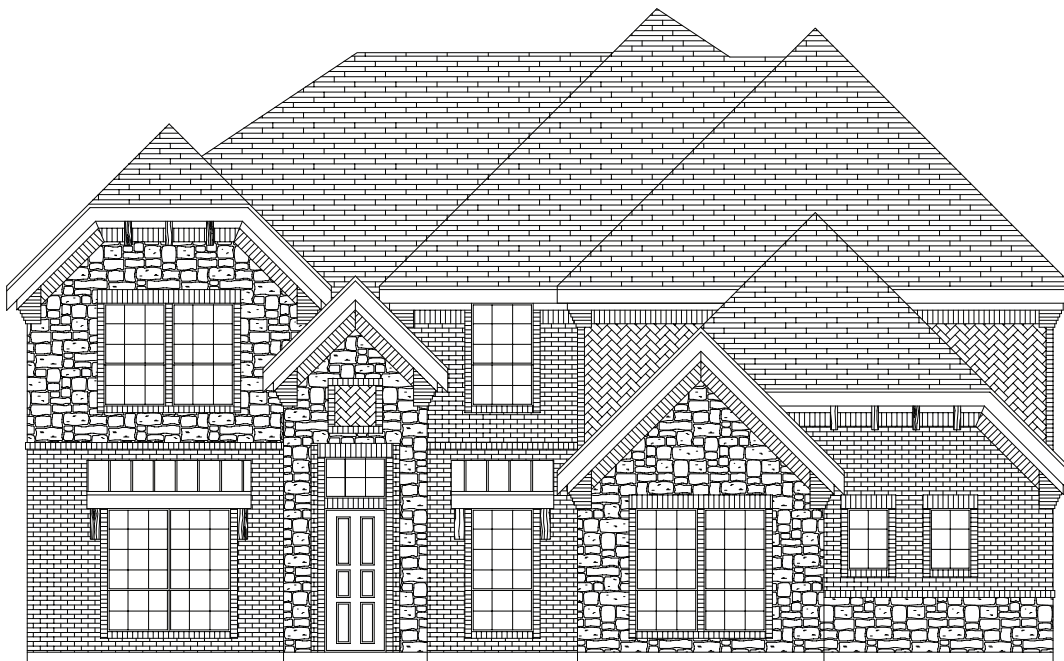
PREMIUM ELEVATION B