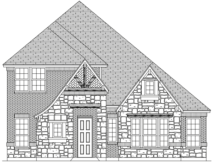
PREMIUM ELEVATION B