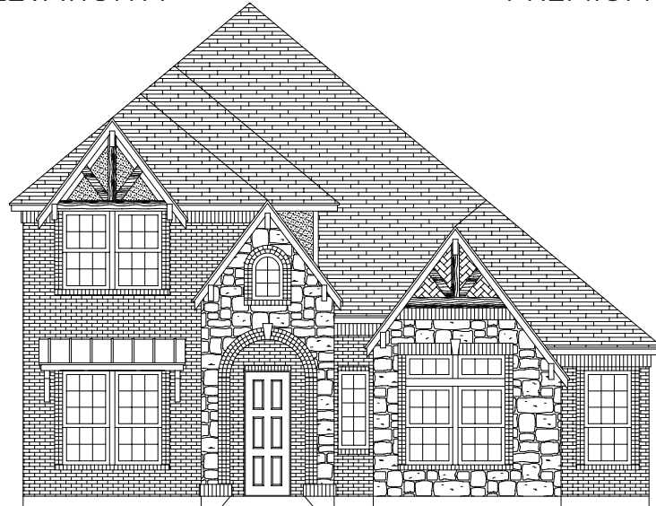
PREMIUM ELEVATION C