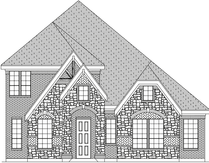
PREMIUM ELEVATION A