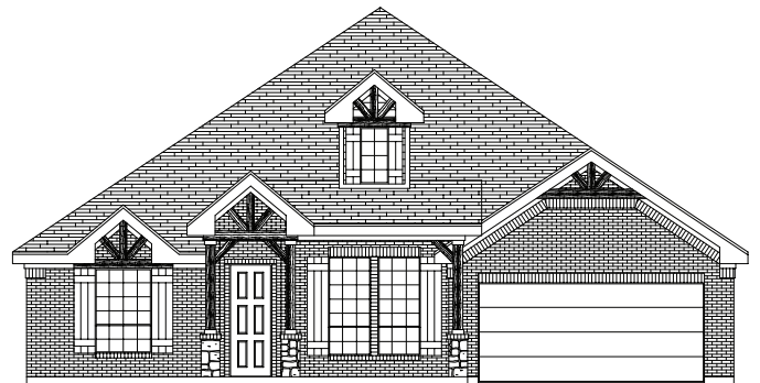
PREMIUM ELEVATION F