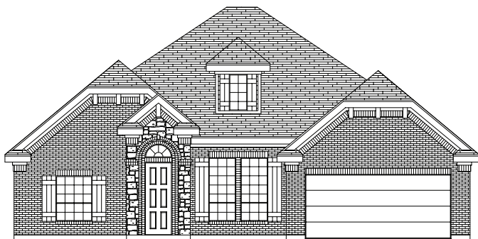
PREMIUM ELEVATION E