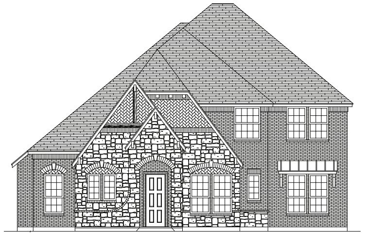
PREMIUM ELEVATION B