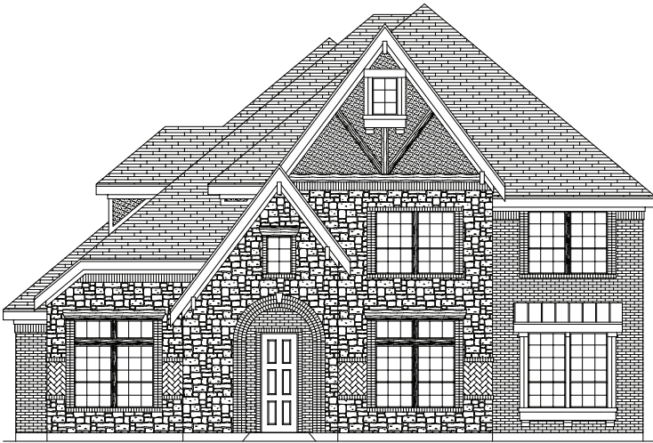
PREMIUM ELEVATION A