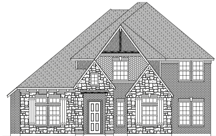
PREMIUM ELEVATION C