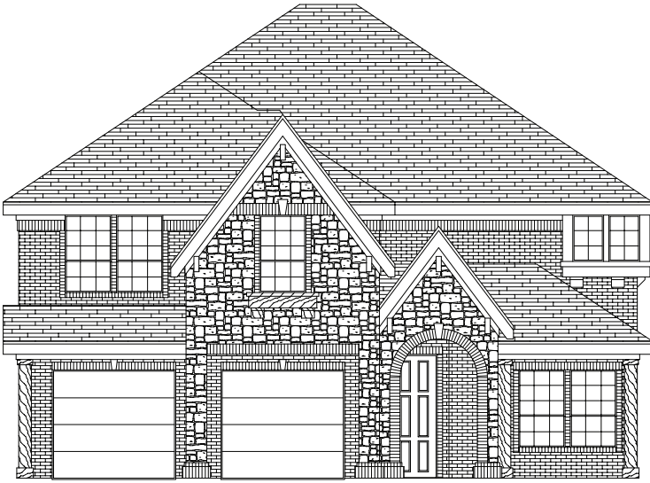
PREMIUM ELEVATION A