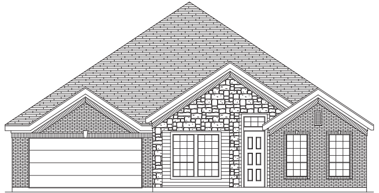
PREMIUM ELEVATION B