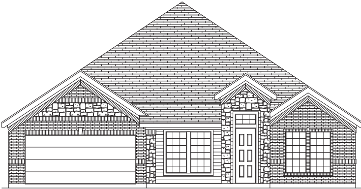
PREMIUM ELEVATION A