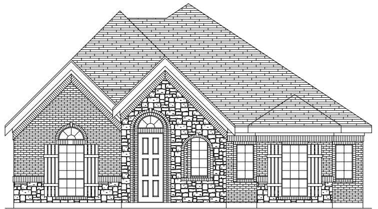
PREMIUM ELEVATION D