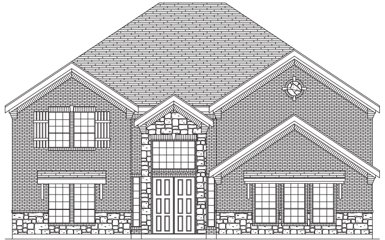
PREMIUM ELEVATION B