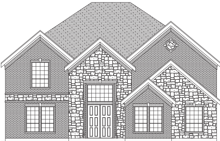
PREMIUM ELEVATION C