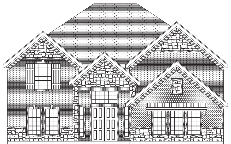
PREMIUM ELEVATION D